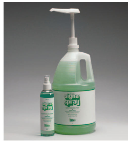
Highly conductive, economical spray electrolyte and non-gritty skin prep.